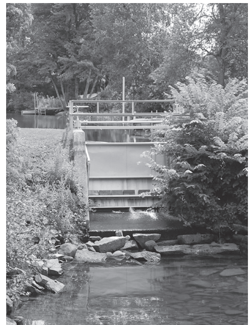
Spillway feeds Hatchery Brook