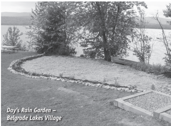
Day's Rain Garden – Belgrade Lakes Village

A highlight of corps work this year was the development of a rain garden at Day's store in Belgrade. This is a model project which demonstrates lake friendly landscaping and planting. All MPSL residents are welcome to visit this site and submit applications to the Conservation Corps for future projects.