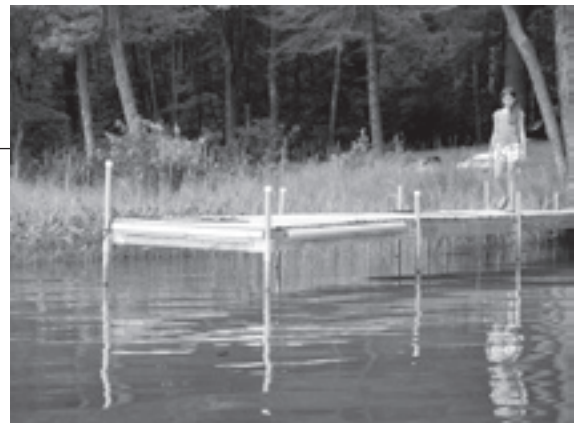
Docks make great water level gauges

“The narrows are too shallow” - “Water levels are too high”, “run off streams are dry”, “the ice is cracking “ - “draw down is too early” - “draw down is too late”