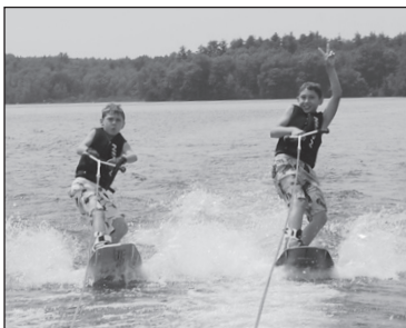
Double the fun on the lakes