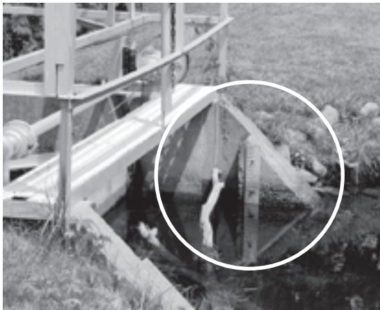
Spillway Level measure at dam site

For decades the dams on Salmon Lake, Long Pond and Great Pond were owned and operated by Central Maine Power. In 1980, as CMP was reorganized, the dams were sold to the Belgrade Development Corp and subsequently acquired by the towns of Belgrade and Rome. The three dams were being operated under the protocol of the Soil and Water Conservation guidelines. In 1985, the select persons of the town of Belgrade petitioned the Department of Environmental Protection to establish a new water level regime for these lakes. After public hearings and a thorough review of criteria, the Belgrade Area Dams Committee was developed with representation and costs prorated to Oakland, Belgrade and Rome based on lake size and town frontage. A water level management plan was established by the DEP, taking into consideration the following Findings of Fact in 1985: